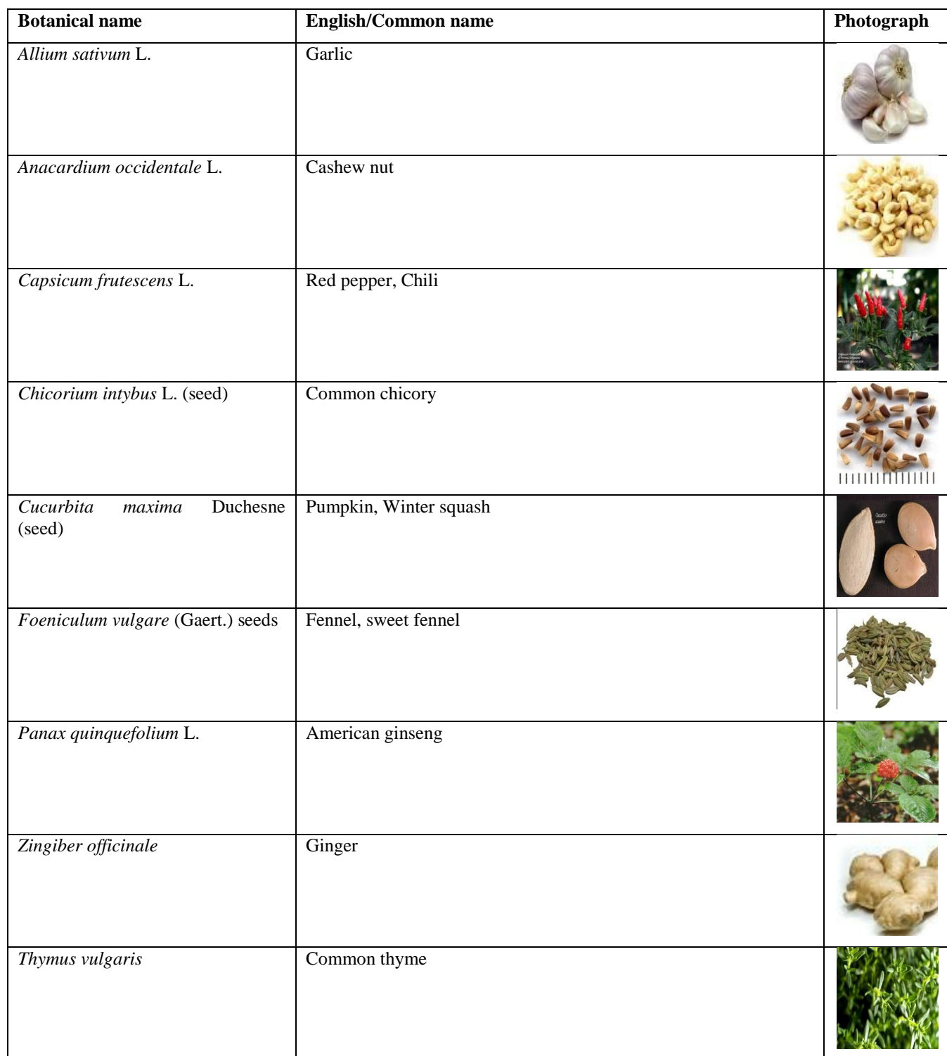
Table 1: List of some herbal plants being utilized for the treatment of obesity

fibres, phytosterols/stanols, dietary carotenoids, polyphenols, plant indoles etc, have potential hypolipidemic properties by different mechanisms such as reducing atherosclerosis by inhibiting platelet aggregation, increasing fibrinolysis, enhancing antioxidant activity, reducing serum lipids in general to lower cholesterol levels, controlling appetite, fat metabolism, adipocyte differentiation, fat absorption, energy metabolism, thermogenesis (generation of heat) etc., which may lead to weight loss 16 .