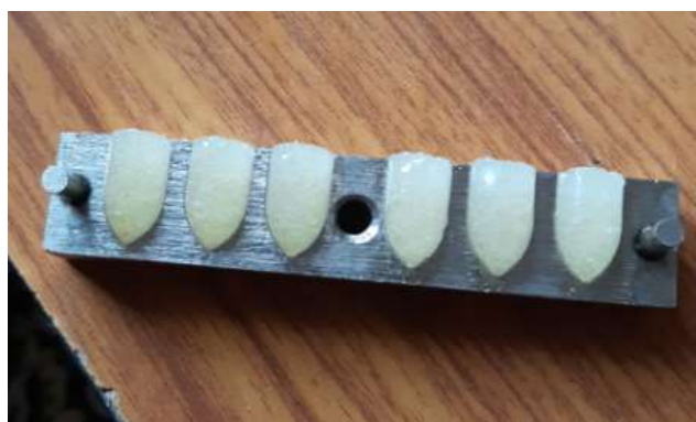
Figure 2: Glycerated gelatin suppositories with 50% drug content

Formulation 1 (F1): Active ingredients for this example are 50% water-based extract of flaxseeds and 50% glycerinated gelatin base. This formulation provides a relatively rigid suppository having high glycerin content.