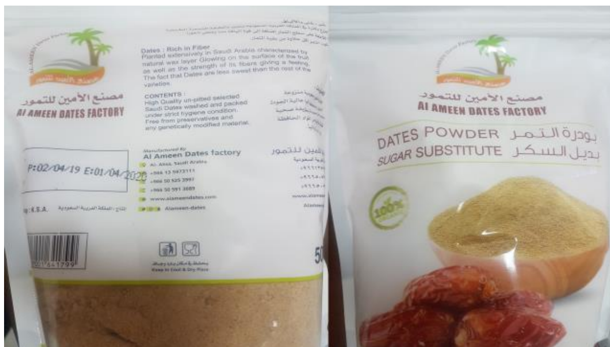
Figure 2: Date powder were bought from AL AMEEN DATES FACTORY (DATES POWDER- SUGAR SUBSTITUTE) Al Hssa-KSA www.alameendates.com