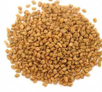
Figure1: Methi (Trigonella foenum gracium linn.) leaves and seeds. 25