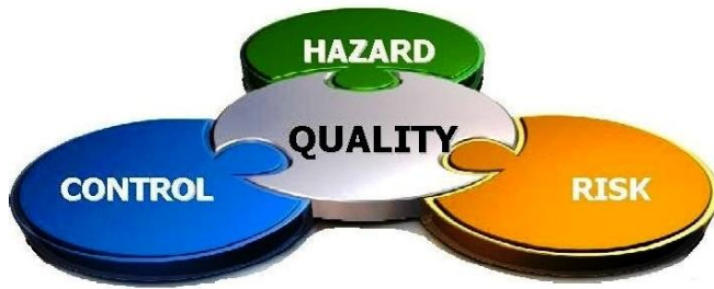
Figure 3 : Risk MaPP

Risk Factors consist of: Hazards or potential sources of harm and consequences or the potential outcomes resulting from the hazard.