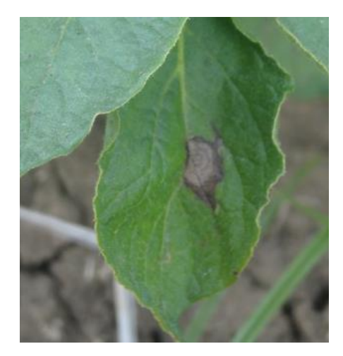
Figure 1: The early blight disease represent as rings in potato plant leaves.

The S. tuberosum belonging to the Solanaceae family of the order Solanales is grown in more than 100 countries around the world. The favorable environmental condition for its production belongs to the temperate, sub-tropical and tropical zones. Mostly cultivated by planting tubers, the temperature range for its optimum growth lies between 18°C to 20°C (64°C to 68°C) 1&2. Potatoes are a rich source of carbohydrates, vitamin C, some of the B vitamins, potassium with a low protein and fat content. They are an excellent supplier of energy rich diet. The antioxidant activity reported in potato is also quite good. The financial and nutritive deal with potatoes is very profitable <sup>3 &4</sup>. The antioxidants found in potatoes are glutathione, ascorbic acid, quercetin and chlorgenic acid. These are soluble in water and act as free radicals<sup>5</sup>. The "King of vegetables" is consumed by more than 1 billion people around the world because of its great nutritive value.All of the fungal diseases mentioned before are quite a disaster for growth and maturation of potato.