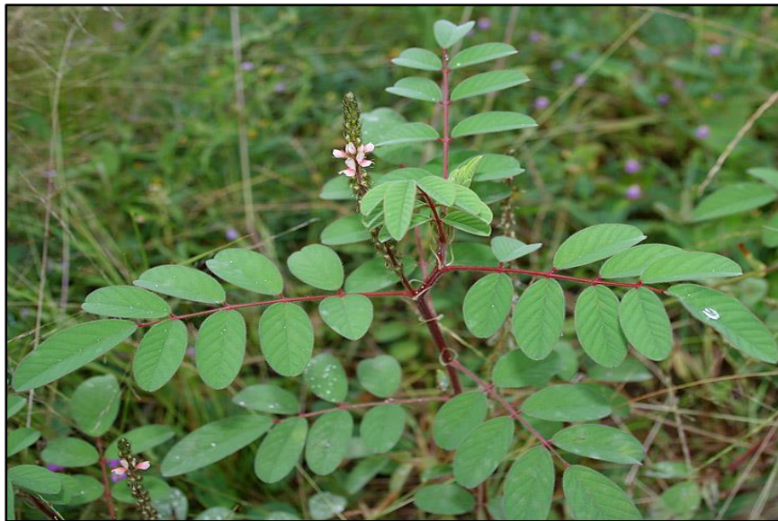
Fig-1: Plant of Indigofera astragalina

characteristics. Some examples of this diversity include differences in pericarp thickness, fruit type, and flowering morphology. The unique characteristics it has displayed include potential for mixed smallholder systems with at least one other species and a resilience that allows for constant nitrogen update despite varying conditions.