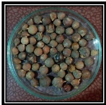
Figure 1: Market sample of Abhal ( Juniperus communis )

The berries of Juniperus communis were procured from the local market of Aligarh city in the month of April 2017. The identity was confirmed with the help of literatures available and Pharmacognosy Section, Department of Ilmul Advia, Ajmal Khan Tibbiya College, Aligarh Muslim University, Aligarh. The sample was further authenticated by National Institute of Science Communication and Information Resources (NISCAIR), New Delhi (NISCAIR /RHMD/Consult/ 2017/ 3089/ 38-3). The specimen of the test drug was submitted to Mawalid-e-Salasa Museum of the Department for future reference with the voucher Number of (SC-0217/17).