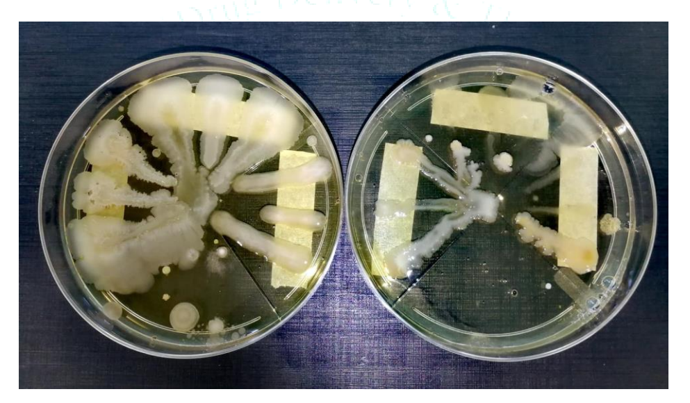
Figure 2: Isolates grown in TSA supplemented with 5 g (A) and 0.1 g (B) copper sulfate.

Bacteria possess copper homeostasis and copper resistance mechanisms because this essential metal is highly toxic and involved in host defense. In Escherichia coli, the cue and cus systems have components that could modify the charge in ionic copper and efflux it<sup>8</sup>. In some E. coli strains, a plasmidborne copper resistance system, pco, confers copper resistance9,10,11. Moreover, the AcrD and MdtABC in E. coli could efflux copper and other antimicrobials when NlpE, an outer membrane lipoprotein is overexpressed<sup>12</sup>. In Salmonella spp., enterobactin and TolC are involved in copper detoxification<sup>13</sup>. Gram-positive bacterium such as Enterococcus hirae imports copper into the cytoplasm via CopA, an ATPase and binding of excess cytoplasmic copper by a copper chaperone (CopZ), which donates it to either a copper export ATPase (CopB) or CopY, which is a copperresponsive repressor of gene expression for the E. hirae cop operon<sup>14</sup>.