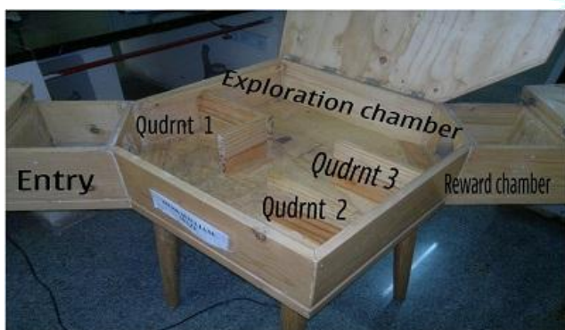
Figure 2: Hebb's William maze

Hebb-Williams maze (HWM): Hebb-Williams maze was taken as the tool for incentive-based exteroceptive behavioral model, useful for measuring spatial working memory of rats. In this model changes in time taken by the animal to reach reward chamber from start box (TRC) were taken as learning and memory enhancing activity. The rat was placed in the animal chamber or start box and the door were opened to facilitate the entry of the animal into the next chamber. The door of the start box was closed immediately after the animal moves into the next chamber to prevent back-entry. The time taken by the animal to reach the reward chamber from the start box was recorded on the first day (training session) for each animal. Each animal was allowed to explore the maze for 3 min with all the doors opened before returning to its home cage. Retention of this learned task (memory) was examined 24 h after the first day trial and on the 27 th day of the treatment. 9