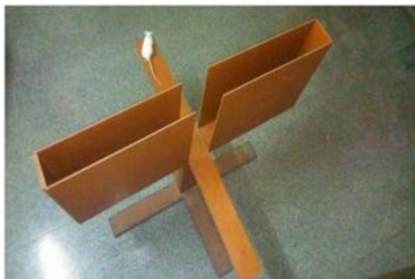
Figure 1: Elevated plus maze

Hebb-Williams maze (HWM): Hebb-Williams maze was taken as the tool for incentive-based exteroceptive behavioral model, useful for measuring spatial working memory of rats. In this model changes in time taken by the animal to reach reward chamber from start box (TRC) were taken as learning and memory enhancing activity. The rat was placed in the animal chamber or start box and the door were opened to facilitate the entry of the animal into the next chamber. The door of the start box was closed immediately after the animal moves into the next chamber to prevent back-entry. The time taken by the animal to reach the reward chamber from the start box was recorded on the first day (training session) for each animal. Each animal was allowed to explore the maze for 3 min with all the doors opened before returning to its home cage. Retention of this learned task (memory) was examined 24 h after the first day trial and on the 27 th day of the treatment. 9