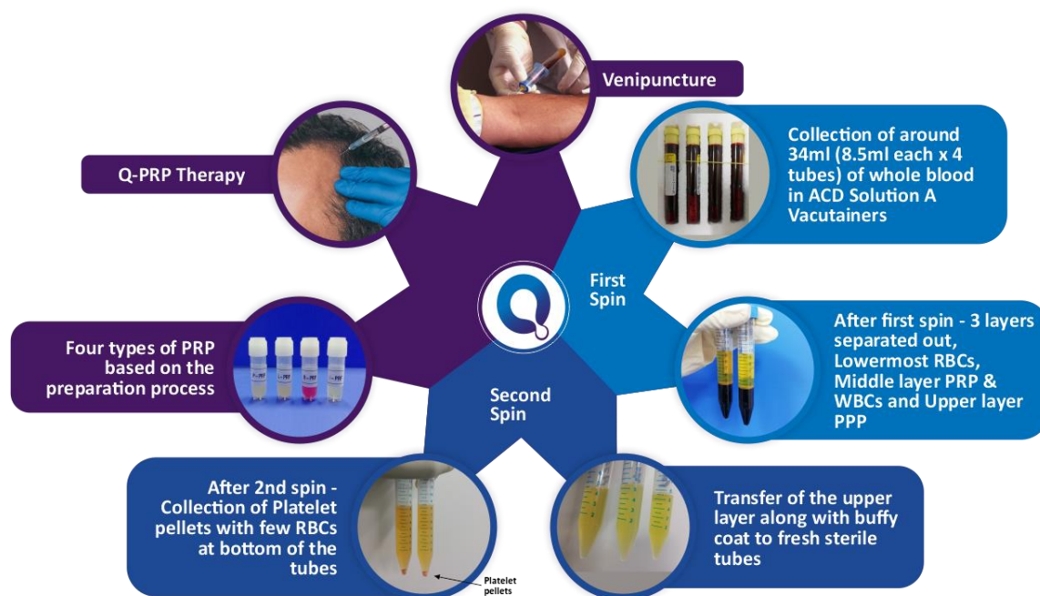
Figure 2: Summarization of the Processing, Preparation, and application of PRP for therapeutic applications.

Pure Platelet-Rich Plasma (P-PRP) – or Leukocyte Poor Platelet-Rich Plasma: P-PRP is platelet concentration with low or no leukocytes and with a low-density fibrin network after the activation process. All the types of PRP can be used in liquid form or an activated gel form. It can therefore be injected or placed during gelling on a skin wound or suture. P-PRP was widely promoted for skin ulcers. In most clinical applications this type of PRP treatment is used, P-PRP is a standard form of PRP. The process of creating the P-PRP involves the centrifugation process of the patient's whole blood to separate the plasma and concentrate the blood platelets, which are then automatically extracted and used for the PRP injection. In this type of PRP, no additives and activation are needed for preparing. P-PRP is more pure, concentrated, and customizable according to the need for treatment.