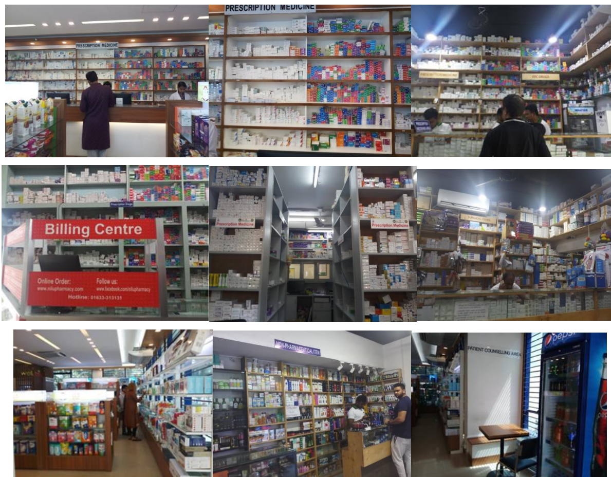
Figure 1: Design of a model pharmacy

This is the inside views of model pharmacy. Here kept medicated and non-medicated product separately. OTC medicine, prescription medicine, surgical item, counseling area and all's have been separated separately. Maintain the area is 300 square ft.