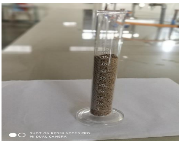
Figure 4: Bulk density

A graduated glass cylinder was used to perform the test 7. (Table 3)