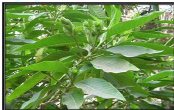
Figure 1: Vasaka leaves

Bronchodilators are recommended for short-term relief of symptoms. In those with occasional attacks, no other medication is needed. If mild persistent disease is present (more than two attacks a week), low-dose inhaled corticosteroids or alternatively, a leukotriene antagonist or a mast cell stabilizer by mouth is recommended. During an asthma attack, the lining of the bronchial tubes swells, causing the airways to narrow and reducing flow of air into and out of the lungs.