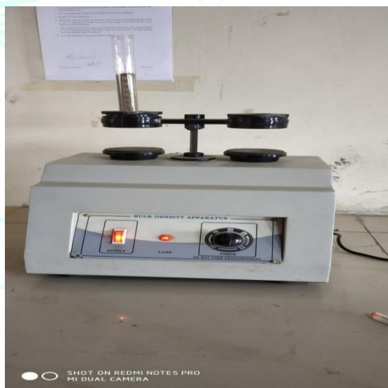
Figure 5: Tapped density

Graduated glass cylinder was used for the test which was subjected to 50 tappings and the volume was noted (Table 3)