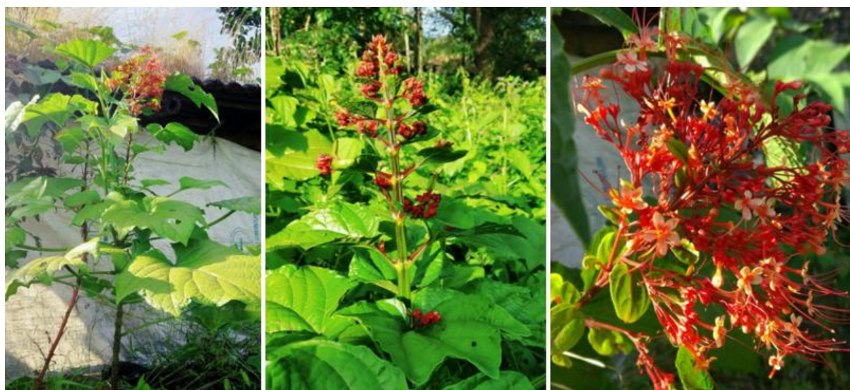
Figure 1: Clerodendrum paniculatum L.

C. paniculatum is an erect, semi-woody shrub reaching a height of 1-2m (Figure 1). Leaves are simple, large, opposite, up to 30cm in diameter. Leaves are membranous, cordate-ovate, 3-7 lobed (lobes shallow), margins minutely denticulate, glandular beneath and petiole is up to 30cm long with acuminate apex. Flowers are in large terminal panicles. Calyx is red to orange-red in color and divided nearly to the base. Corolla are orange-red to scarlet with slender tube which is up to 2cm long and the lobes are approximately 7mm long. Flowering occurs more or less throughout year. Fruit is a drupe, globose, bluish-black in color and approximately 1cm across. 12,17,18